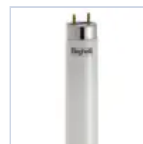
56230 T8 ECOLED STD 600MM G13 9W 840