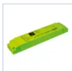
19367 INV P&L LED SE/SA 1H 60- 180V