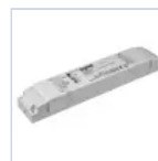
19399 INV UNIV CT 5W 20-240V