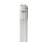
56213 ETUBE LED T8 600MM 9W G13 840