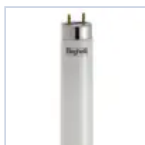
56232 T8 ECOLED STD 1200MM G1318W840