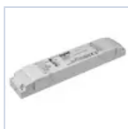
19398 INV UNIV AT RM 5W 20-240V