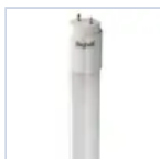
56216 ETUBE LED T8 1200MM 18WG13 840